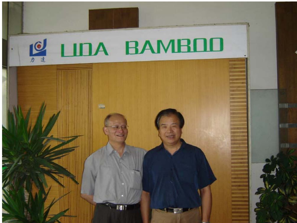
Pilot Factory - Lida Bamboo Processing Co. Ltd. in Fuyang City, Zhejiang province