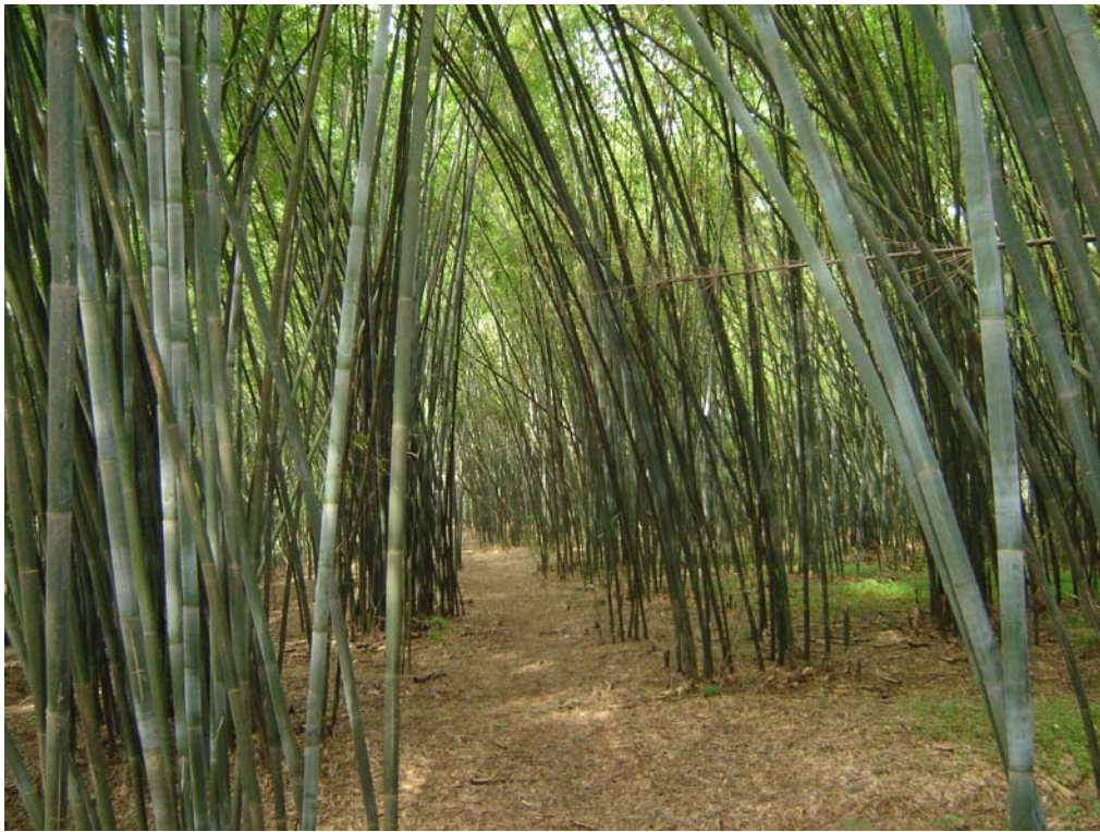
Bamboo Experimental Site at Rogou, Guangning County